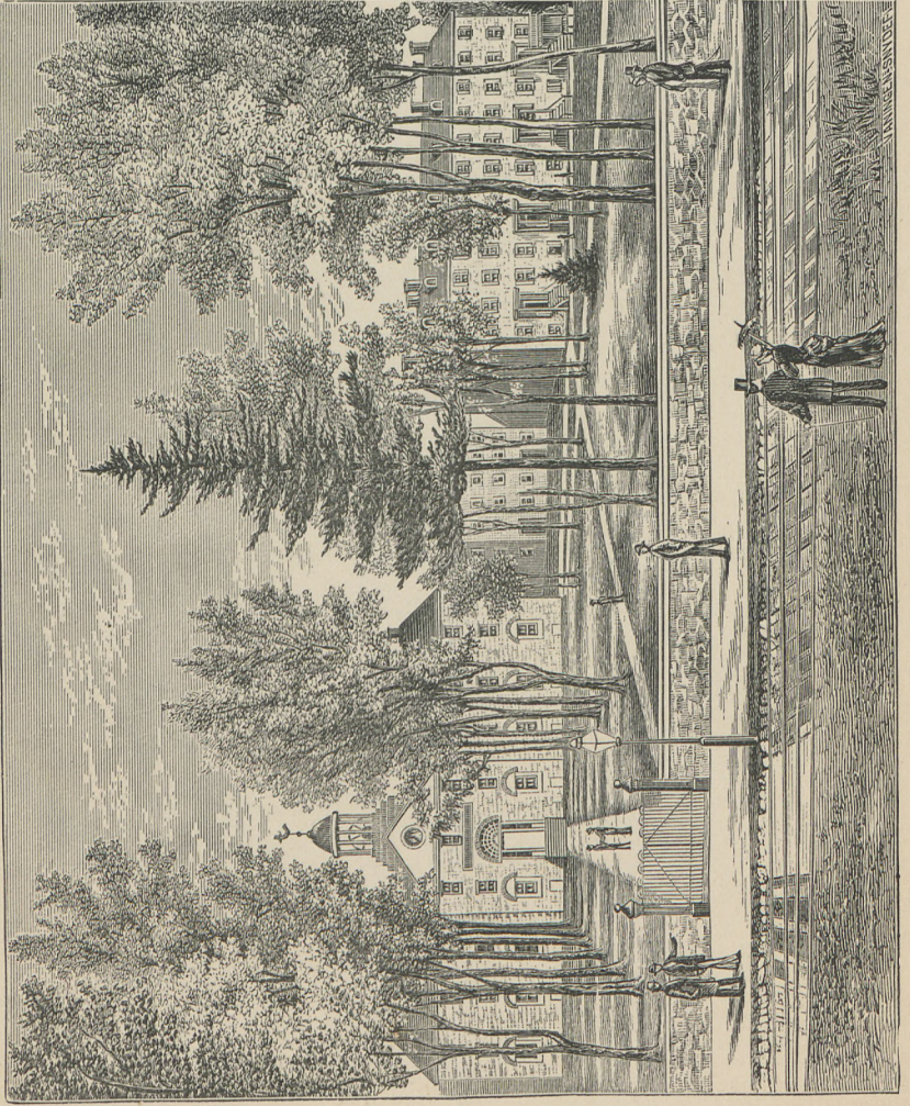
DICKINSON COLLEGE, CARLISLE, PA.